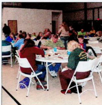
Last years Thanksgiving Dinner at Brown Springs Fellowship Hall

Links to important information are below