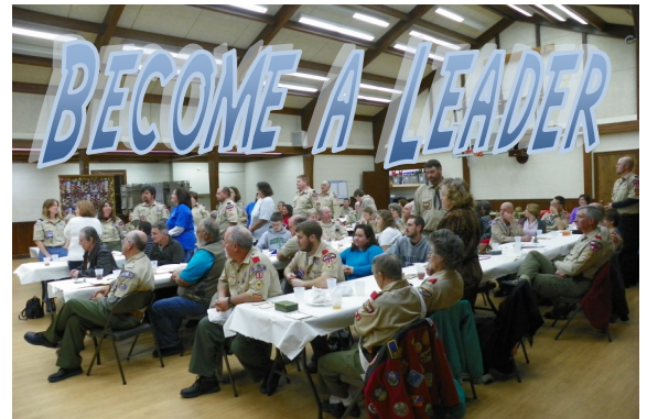
The Scouts Still need your leadership

Any parent or volunteer who would like to volunteer to do some of the editing on the website, we welcome you to contact Gerry for information on tools, access and methods. Some of the incomplete pages are begging for a volunteer editor to fill in some of the blanks .