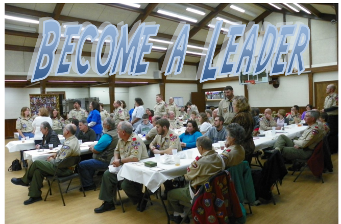
2011 Leaders award Banquet Join us at the next Roundtable to start your journey to becoming a leader. The Scouts need your leadership

We really need some of the current parents to "Step-up" and start their training towards becoming a leader. Our current group of leaders will be advancing on with the scouts next years, leaving some dens without any one to step in as the den leader.